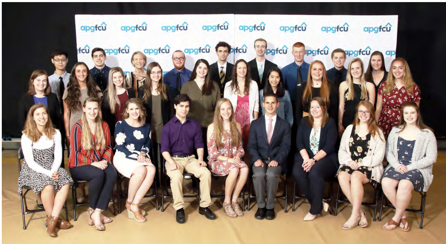
CAPTION: APGFCU Student Member-Owners Continue to Shine Academically