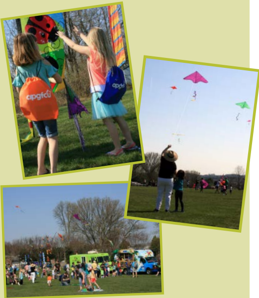
Photos above feature the 2018 Bel Air Kite Festival at Rockfield Park