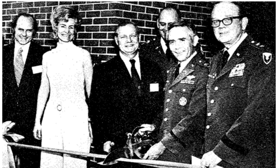
APG Branch Ribbon Cutting - 1975

The official election ballot is included with your December statement mailing.